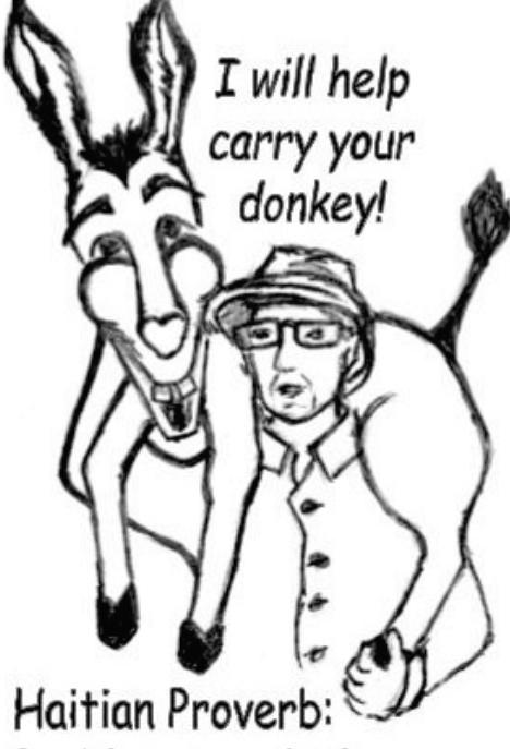
Haitian Proverb: Problem is a donkey. Will we mount it or will it mount us?

"We invite you to share God's Word and the donkey with all who need help handling their problems."